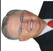
Pastor John Hagee